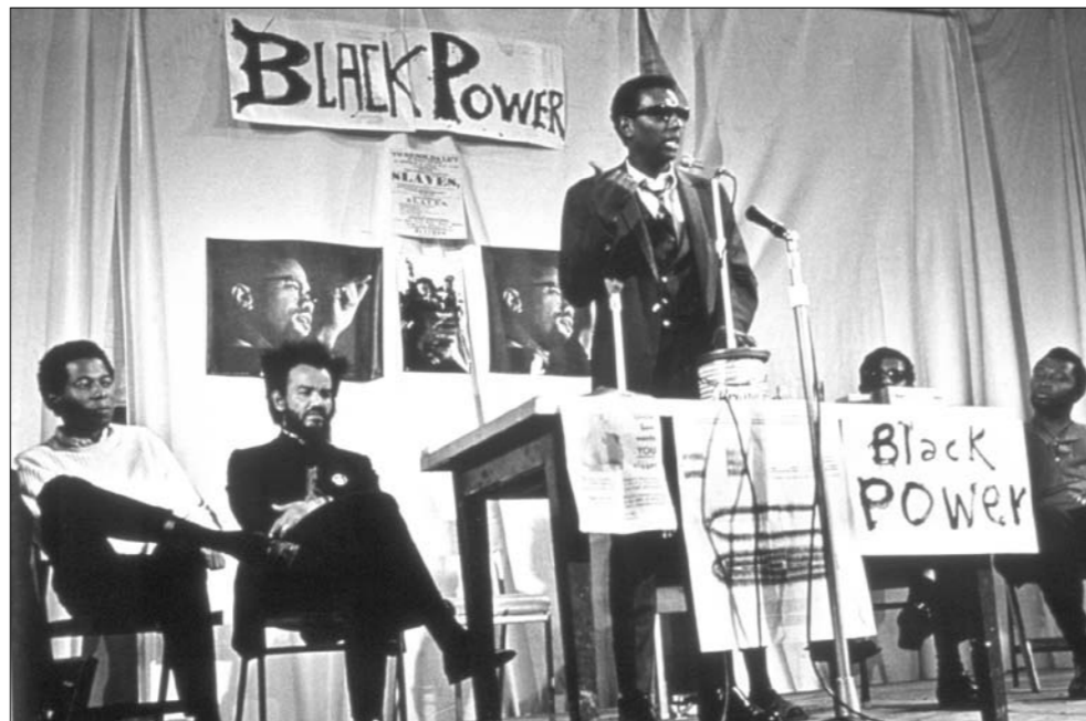
Stokely Carmichael at Black Power Conference, The Roundhouse

The BFI is releasing in October 2005 a DVD of two of Horace Ové's films Pressure 1975 and Baldwin's Nigger 1969 BFIVD714. Copies will be available from the Norwich Gallery price £19.99 p&p £1 cheques to Norwich School of Art and Design .