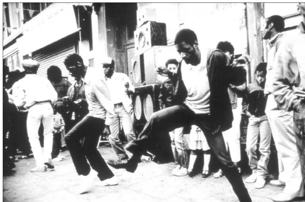
Street Corner Sound System, Notting Hill, 1970's